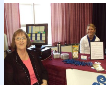
ley Chiropractic & Massage