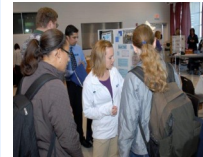
Orthopedic & Spine Physical Therapy