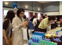
Wal-Mart Vision Center