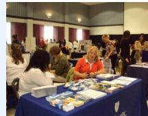
Highmark Blue Shield