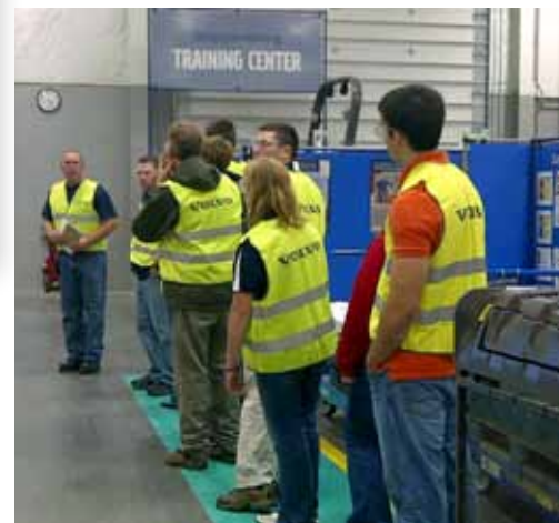
SCM/Logistics Club members toured Volvo Construction Equipment in Shippensburg.

Every month the South Central Pennsylvania Council of Supply Chain Management Professionals (CSCMP) Roundtable hosts an event that members can attend. The events range from dinner presentations to facility tours and provide club members with excellent opportunities to network with professionals and stay