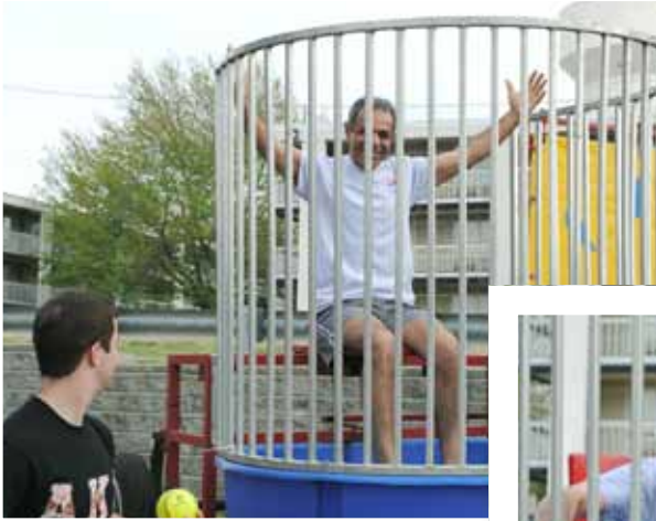
Students relished the opportunity to put their dean or professor in the dunk tank.

Students, faculty, and staff enjoyed a special Spring Social in April to commemorate the 30-40-75 Celebration of Milestones in the Grove College of Business.