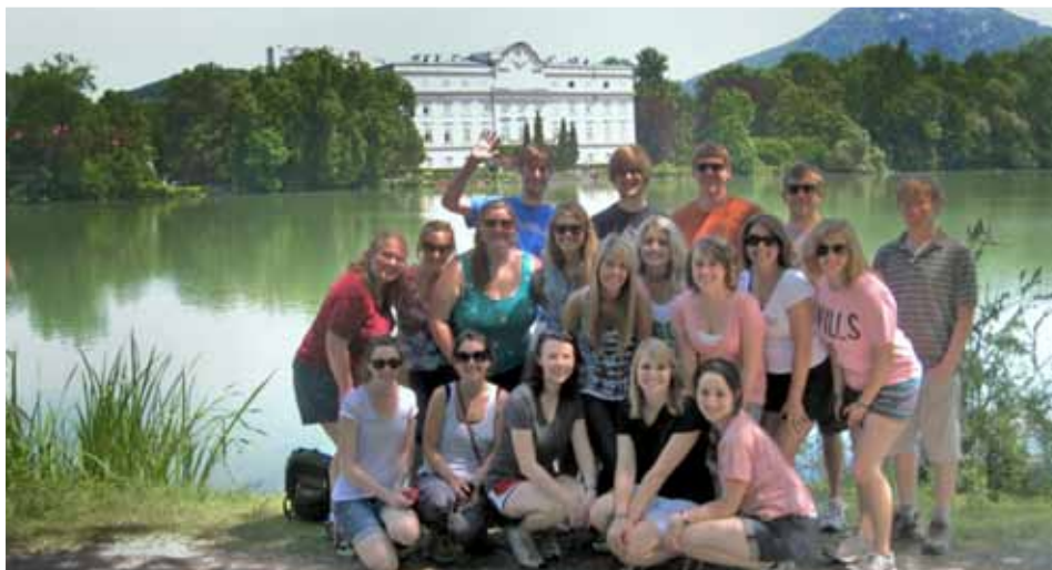
The entire AIFS group in front of one of the locations in The Sound of Music .