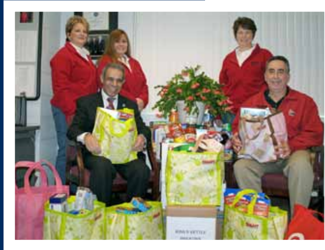
The John L. Grove College of Business participated in their first annual food drive for King's Kettle Food Pantry in 2011. With the help of students, faculty, and staff, they were able to collect over 300 food donations, as well as some monetary donations. They plan to continue this tradition every year before the holidays!

Our Grove College of Business faculty's goal is to provide students with a base of knowledge and skills for a lifetime of learning in a professional career of their choice. The faculty, over 95 percent of whom hold a doctorate in their field of instruction, pride themselves in offering a highly personalized learning environment. Equally important, the educational experience of our students is guaranteed to be state of the art because our faculty members continue their professional growth through research and their work as consultants. In addition, our modern classroom building, Grove Hall, was designed with a 21st century education in mind. Our small classes enable students to interact on a one-to-one basis, and this allows our faculty to help students develop strong communication, interpersonal, and teamwork skills which are vitally important in today's business world.