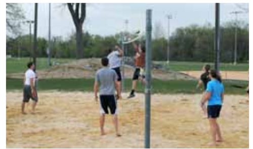
Students competed in the second annual volleyball tournament (above), challenged the faculty and staff to kickball (left), and enjoyed other backyard games (below).