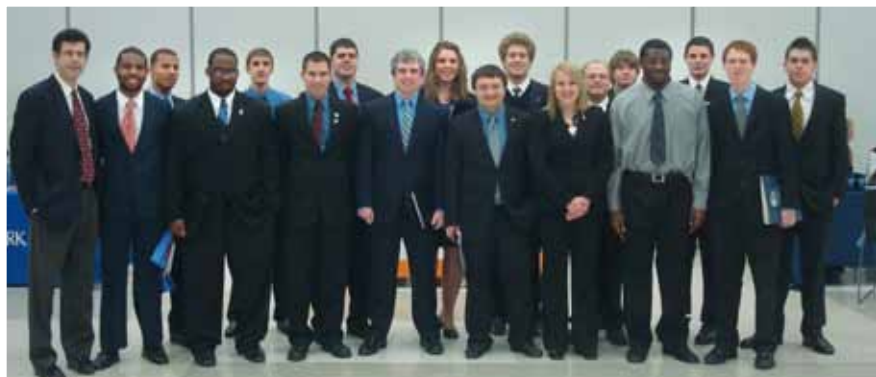
MIS Club members looking sharp at the bi-annual MIS Career Fair.