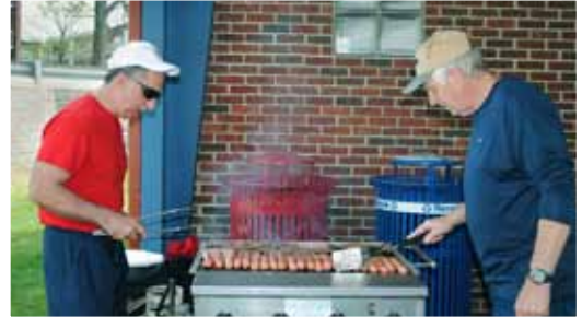
Dean's office personnel, with assistance from the Shippensburg Kiwanis, were busy grilling hamburgers and hot dogs for everyone.