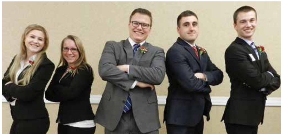
Students attend Accounting Etiquette Dinner

At the spring SIS Fair, we gained thirty new members and restructured club meetings. In February, we held the "Real World Panel" with representatives from North Western Mutual, Vartan group, Massimo Zanetti Beverages, Purple Deck Media, and Ahold. The club gained insight from alumni who answered questions about their career paths. In March, about fifty people attended the "Game of Life Speakers Panel" with representatives from Ahold.