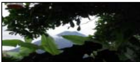
A view of Volcan Arenal

My trip to Costa Rica was an unforgettable experience. I was challenged to change my way of thinking and step out of the comfortable life I had made for myself. I was challenged both mentally and physically and learned I could do things I never thought possible. I made some amazing friendships as well. All I can say to anyone who may be thinking about applying for the SSHE Honors trip in 2005 to France is DO IT! Don't put off applying or make excuses. I am so grateful to Shippensburg's Honors Program for choosing me for this program and to Slippery Rock for sponsoring, planning and running an amazing trip. I am always available to anyone who has questions or a desire to know more. Pura vida! Rice and beans forever!