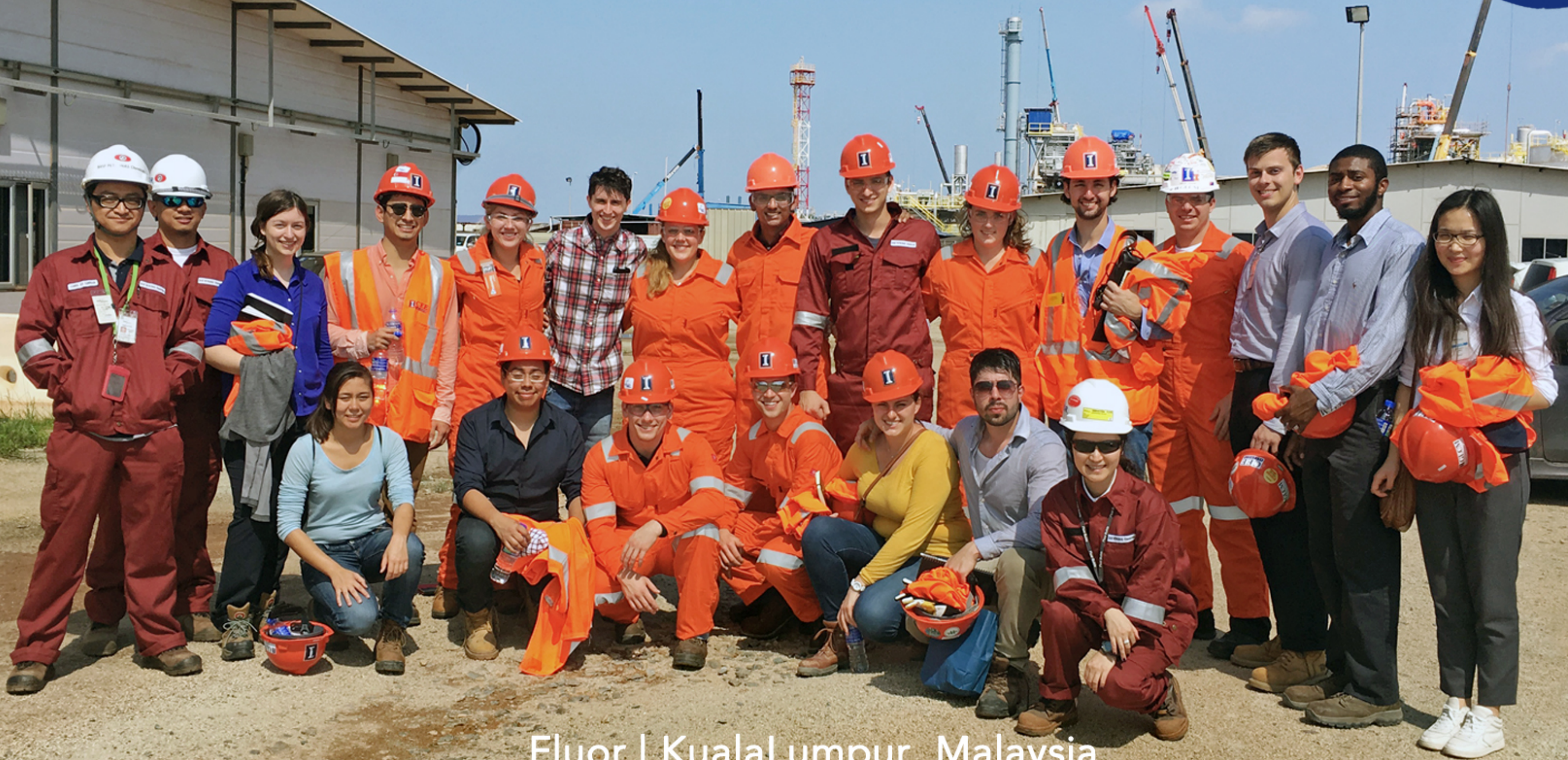
Fluor | Kuala Lumpur, Malaysia