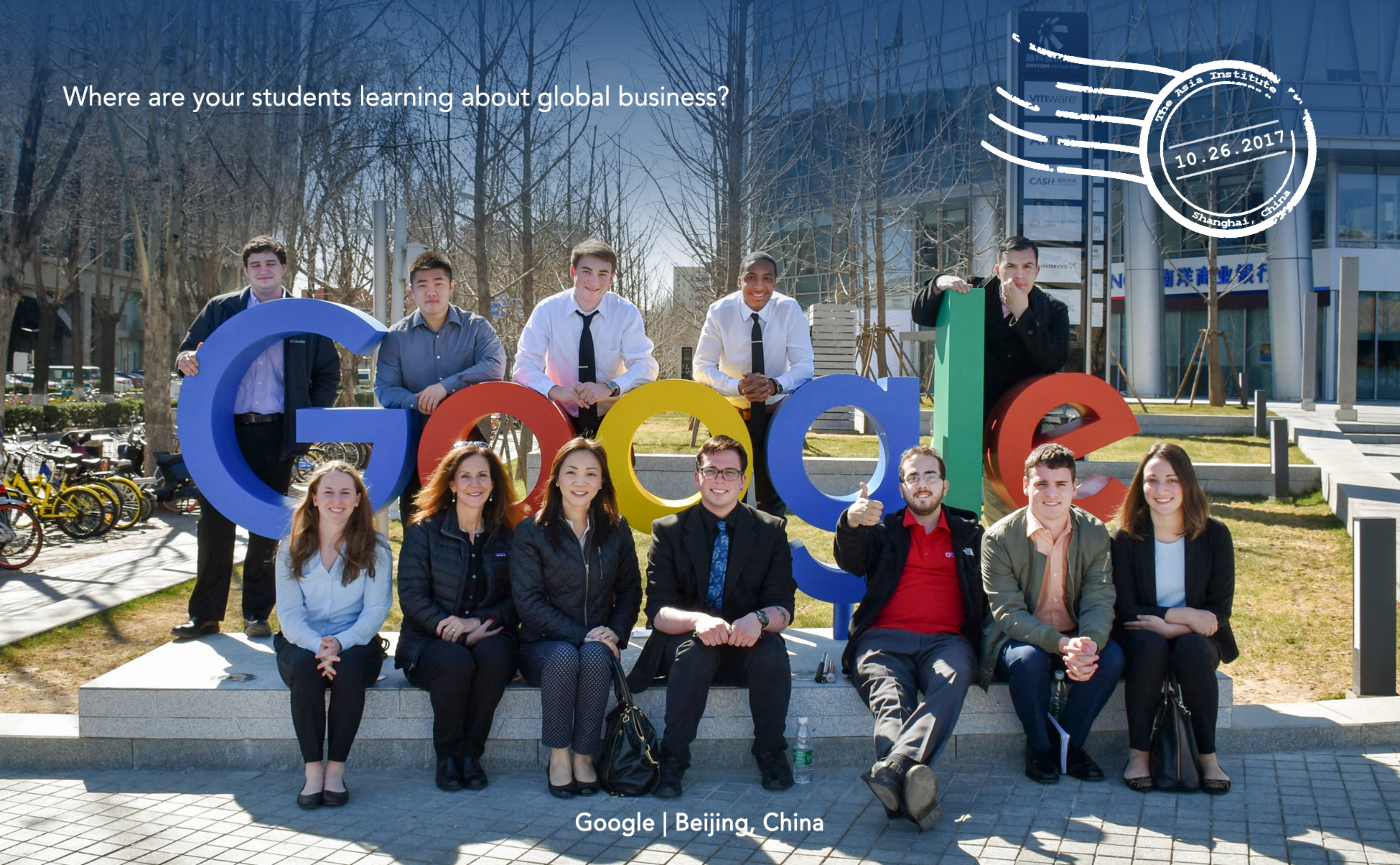
Google | Beijing, China