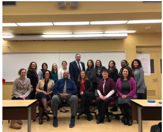
Pictured: Harrisburg BSW seniors with social work faculty