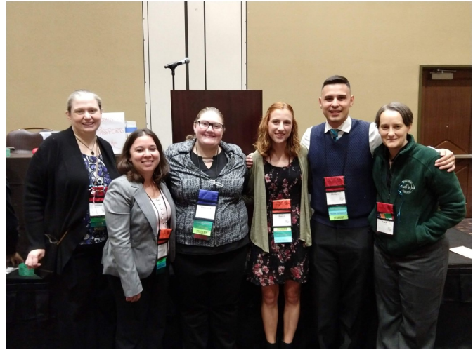
Pictured: BSW Research Club at NASW-PA Conference